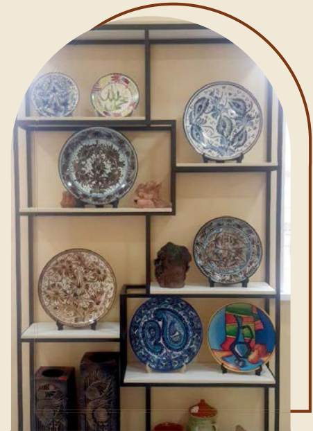
Art therapy sessions