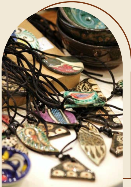
Design and ornamentation